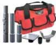
SAFE JACK BOTTLE JACK RECOVERY KIT