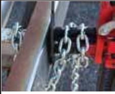
SAFE JACK 6 foot Chain