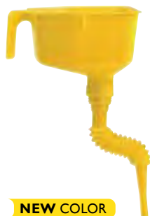
10710 Multi-Task 5-in-1 Funnel™ NEW COLOR