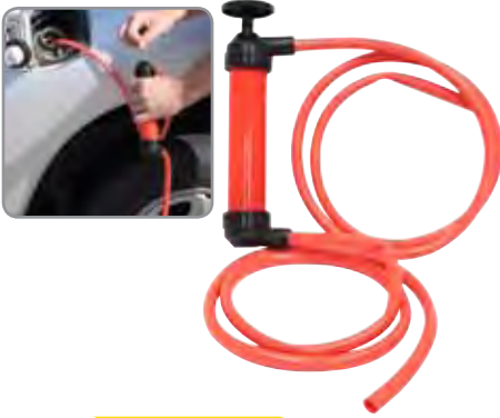
10803 NEW PRODUCT Multi-Purpose Transfer Pump™