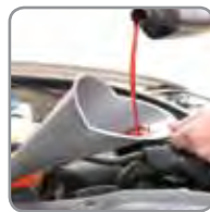
10712 Super Multi-Purpose Funnel™