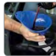
05060MI Flex Funnel™ NEW DESIGN