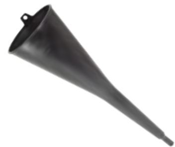
05034MI Extra Large Funnel NEW DESIGN