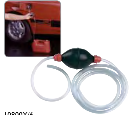
10800X/6 Super Siphon™