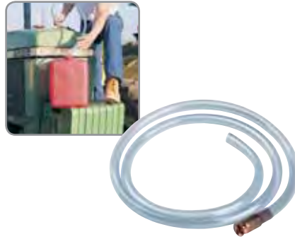
10801 Shaker Siphon™