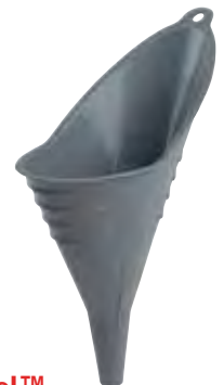
10716 Tight Spot Funnel™