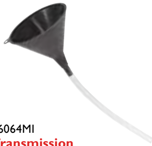
06064MI Transmission Funnel NEW COLOR