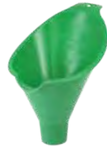
10713 Big Mouth Funnel™