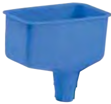
10709 Locking Oil Funnel™