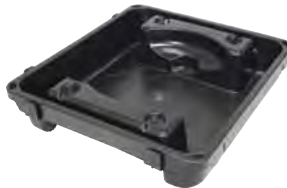
80050 Hand-E Hauler™ NEW PRODUCT