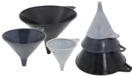
Multiple Parts General Purpose Funnel NEW COLORS