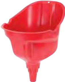
10705 Giant QuickFill Funnel™