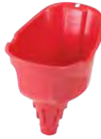
10714 Super QuickFill® Funnel