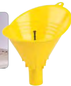
10711 Fuel Gauge Funnel™