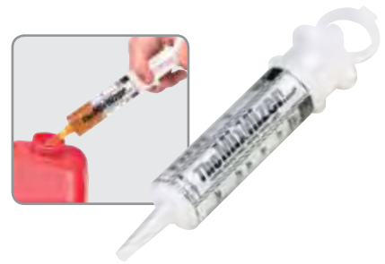
10111/6 MixMizer® Injector